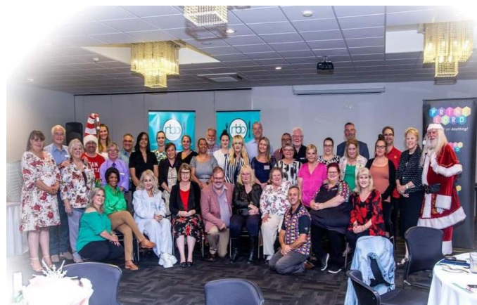
Some of the 2023 NBB cohort

For photos and updates on the NBB check out our Facebook page https://www.facebook.com/mynbb/