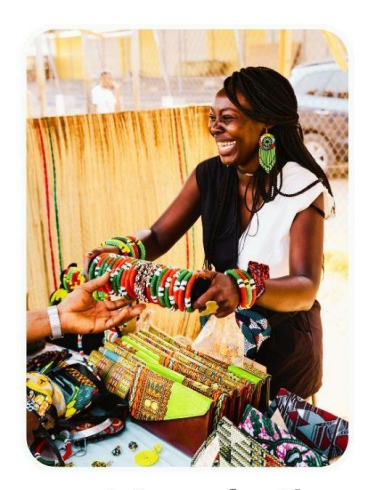
Monthly Pop-Up Market

If you want to grow your small business, this is the perfect opportunity for you! Get in touch with us to secure your spot today! Email <a href="mailto:cml@angaet.com.au">cml@angaet.com.au</a> or call 0438 536 025 for further details or to book your place.